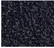
Anthracite 007 NCS: 8500N