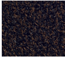
Brown 014 NCS: 8502R